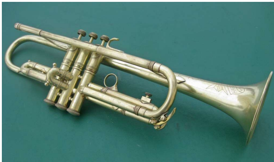
Trumpet #99578 below