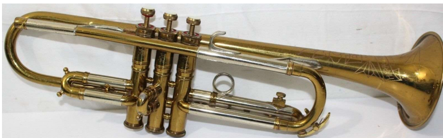
Master Art #119479